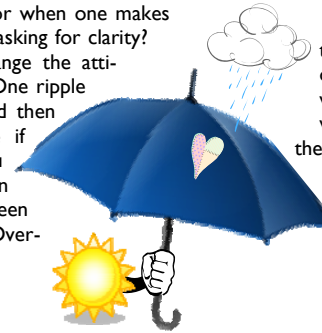
Excerpts have been used from the September 2007 newsletter.

It takes one person to open the door for God to enter our hearts but it takes the whole body to complete the work together. Don't forget, the children are why we do this.